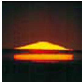
Figure 11. Real picture of a Novaya-Zemlya.