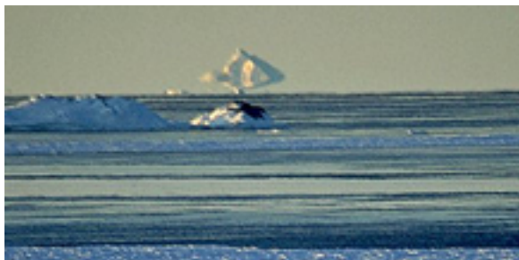
Figure 7. A real inferior mirage.

The arctic mirage occurs when there is an increase of temperature with height near the ground. As a consequence, the light rays approaching the ground are curved downward. Figures 3 and 5 show real pictures of arctic mirages while figures 4 and 6 show the respective rendered simulations. For both simulations, an inversion layer was placed centered at 100 meters, with a temperature gradient of 10^{\circ}\text{C} .