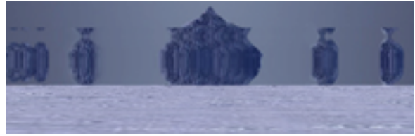
Figure 10. Rendered image of the Fata Morgana.