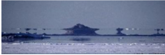
Figure 9. Fata Morgana mirage in Greenland.