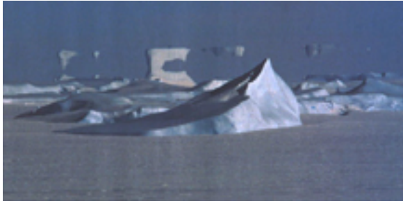
Figure 3. A real arctic mirage.