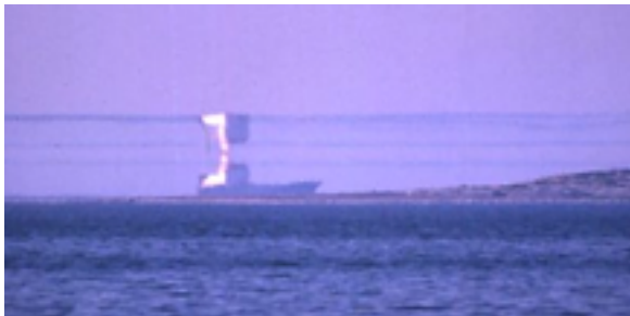
Figure 5. An arctic mirage of a ship in Finland.