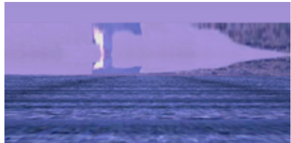
Figure 6. Rendered simulation of the arctic mirage