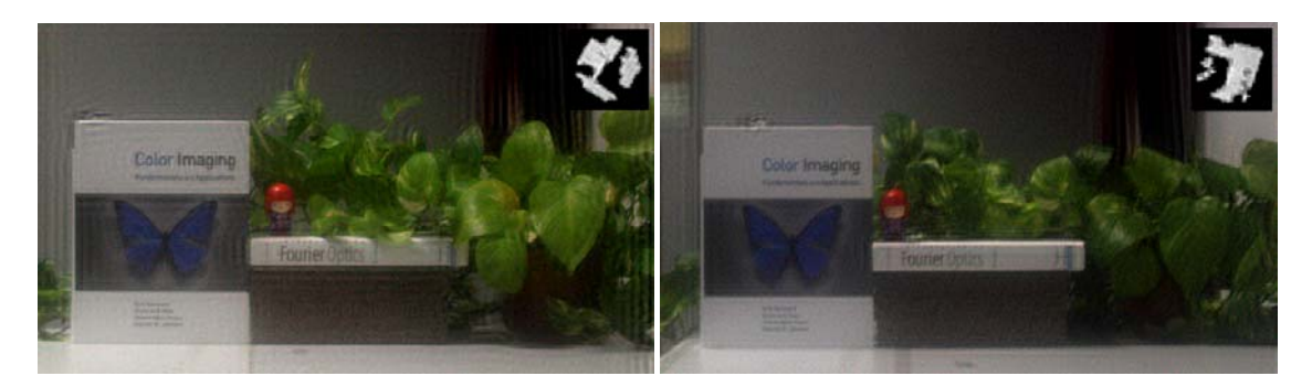
Figure 2: Recovered images captured with the aperture proposed by Zhou et al. [1] (left), and with our best perceptually-optimized binary aperture (right). Note the drastic reduction of ringing artifacts.